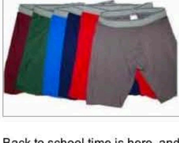
Back to school time is here, and parents and college students are readying clothing and gear for another year of sports and activities.